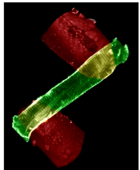
Cardiomyocyte labeled with Di-8-ANEPPS (green), attached to two glass micro-rods via MyoTak (red).

The MyoStretcher can be configured as a stand-alone system or as a modular add-on for your existing IonOptix Myocyte Calcium and Contractility System.